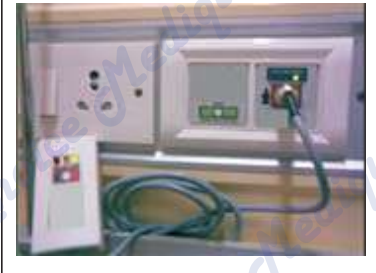
Nurse Call System