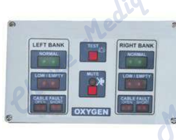
Audio Visual Alarm System