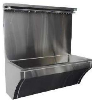
Catheter Wash Sink For Cathlab