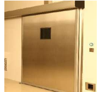
Radiation Safety Lead Doors