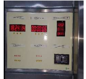
Surgeon's Control Panel