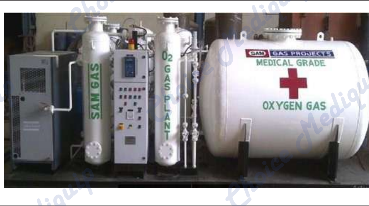
PSA Oxygen Generator Plant

In association with SAM GAS PROJECTS PVT LTD. We provide Medical Grade Oxygen Generators with PSA (Pressure Swing Adsorption) technology.