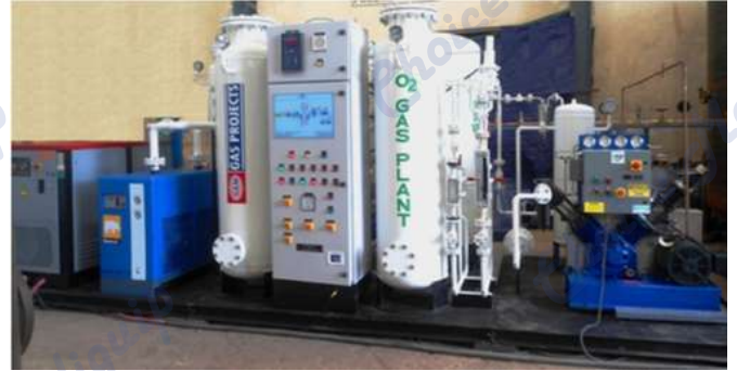
PSA Oxygen Generator Plant With Booster For Cylinder Filling