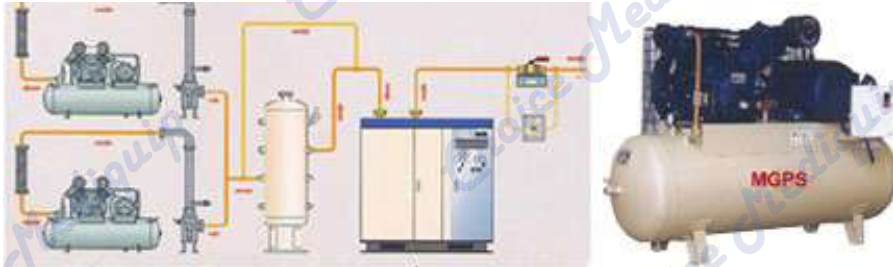
Medical Air Compressor