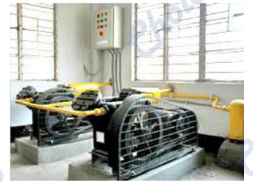
Medical Vacuum Pump System