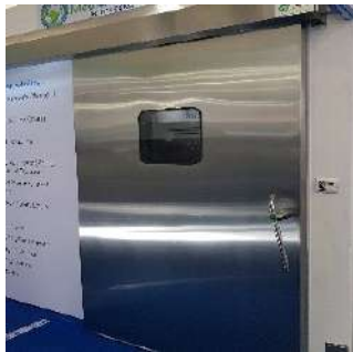
Hermetically Sealing Type Sliding Door