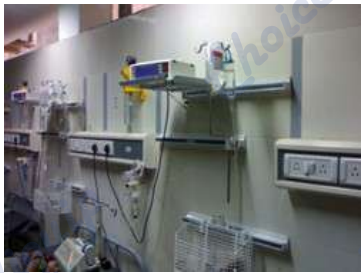
Bed Head Panel