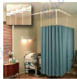
Hospital Curtain Track System