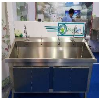
Surgical Scrub Sinks