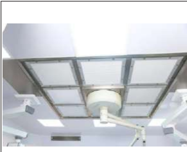
Laminar Flow System