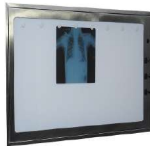
X-Ray Film Viewer-3 Film