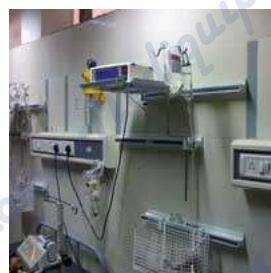
Medical Rail System