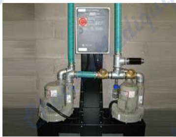
Anaesthetic Gas Scavenging System