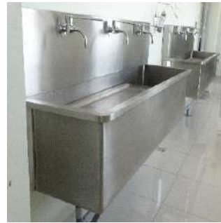
Hospital Wash Sink-Surgical