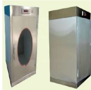
Pass/Hatch Box (Manual/Digital Controlled)