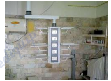
Operation Theater Pendant