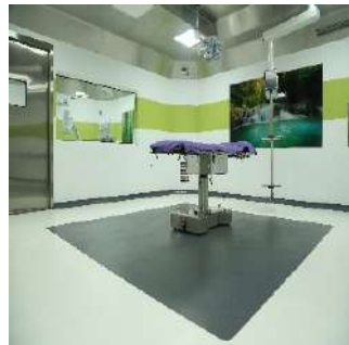
Operation Theater Floorings